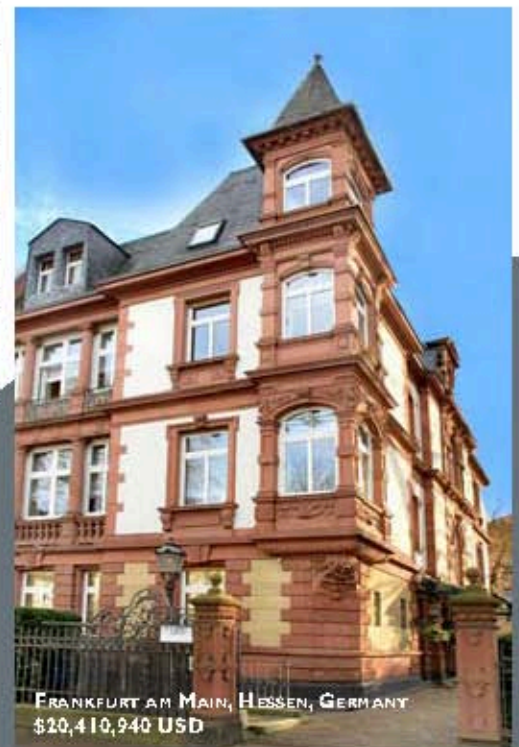
FRANKFURT AM MAIN, HESSEN, GERMANY $20,410,940 USD

According to Anita, in times of crisis the Hamburg property market demonstrates its sustainability and stability.